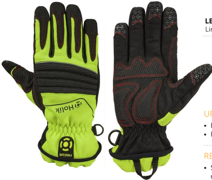
LESLEY Plus 6510 Lime green

Protective gloves for rescue operations. Lesley is valued for its high visibility, perfect dexterity while preserving high protection and a convenient cuff with textile preventing ingress of dirt.